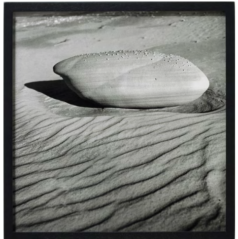
Galet sur le sable, 1935